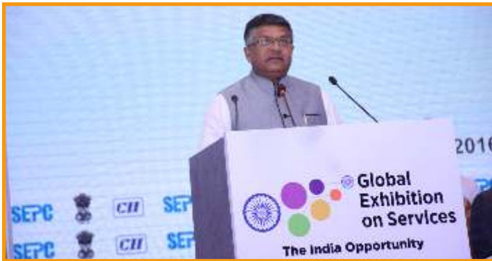
Sh. Ravi Shankar Prasad

Minister for Communications & Information Technology and Law & Justice, Government of India in GES 2016