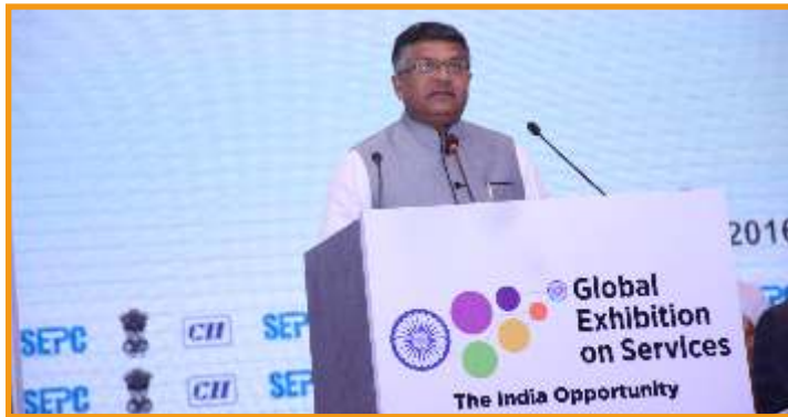
Sh. Ravi Shankar Prasad

Minister for Communications & Information Technology and Law & Justice, Government of India in GES 2016