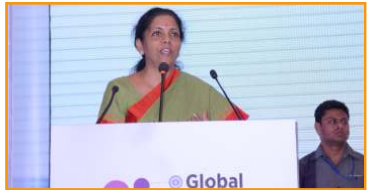
Smt. Nirmala Sitharaman

Minister for Communications & Information Technology and Law & Justice, Government of India in GES 2016