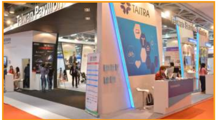
Exhibition Showcase in GES 2016