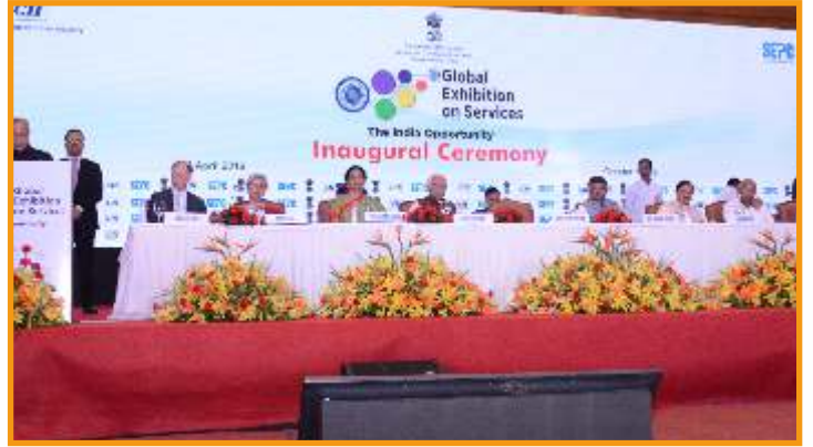
Inauguration of GES 2016 by Hon'ble President of India, Shri Pranab Mukherjee on 20 April, 2016